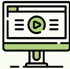
'Financial training obligation and compliance audit' webinar