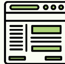
Approved financial training webpage